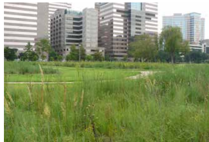
MD Anderson Prairie

The prairie is a living nursery, wildlife habitat, and a peaceful respite for both caregivers and families undergoing cancer treatment. Additionally, the prairie serves as an urban ecology station where ecologists are tracking wildlife colonizing this pocket of nature.