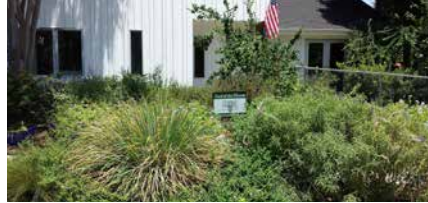
August Garden of the Month

planted which attract the Swallowtail and Gulf Coast Fritillary butterflies, respectively.