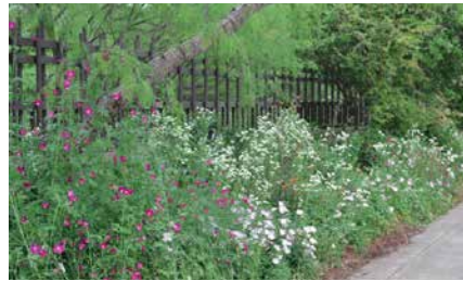
Inwood Native Garden

Only a limited number of visitors can be accommodated on this tour, so RSVP at info@heightsgardenclub.com as soon as possible to reserve your spot.